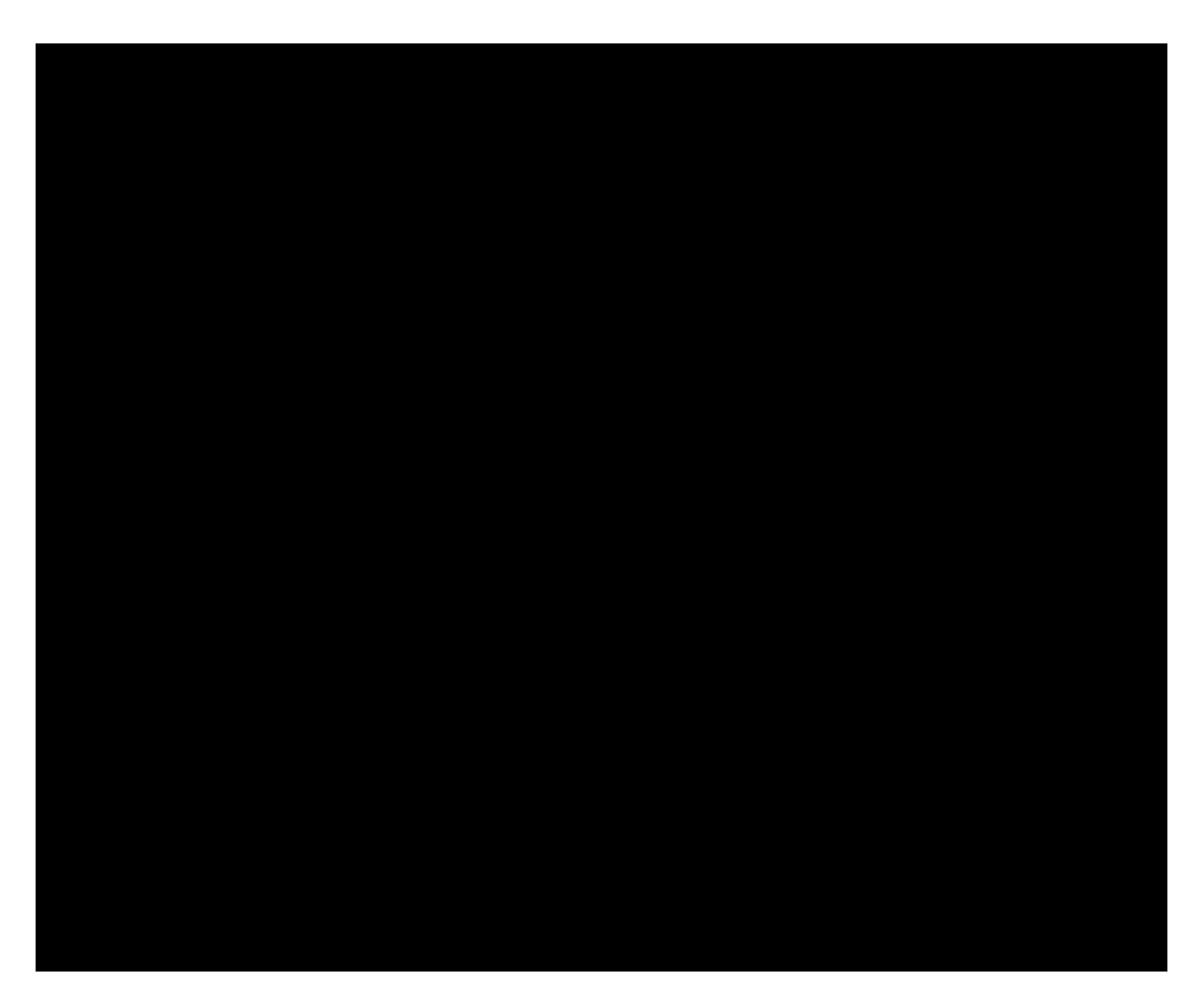
Table 2: Project mobilising of matched funding during the reporting period (1 April 2022 – 31 March 2023)